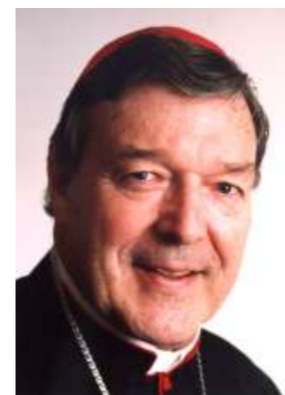
His Eminence George Cardinal Pell

Cardinal George Pell, the Catholic Archbishop of Sydney, is now the official Patron of the Arrow Bone Marrow Transplant Foundation. For twenty years Arrow has funded research into adult stem cell therapy leading to positive results in the treatment of blood cancers like leukaemia, lymphoma and a number of non-malignant disorders.